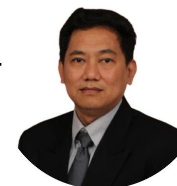
Fendi Finance Director