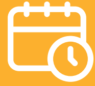
Table Of Content